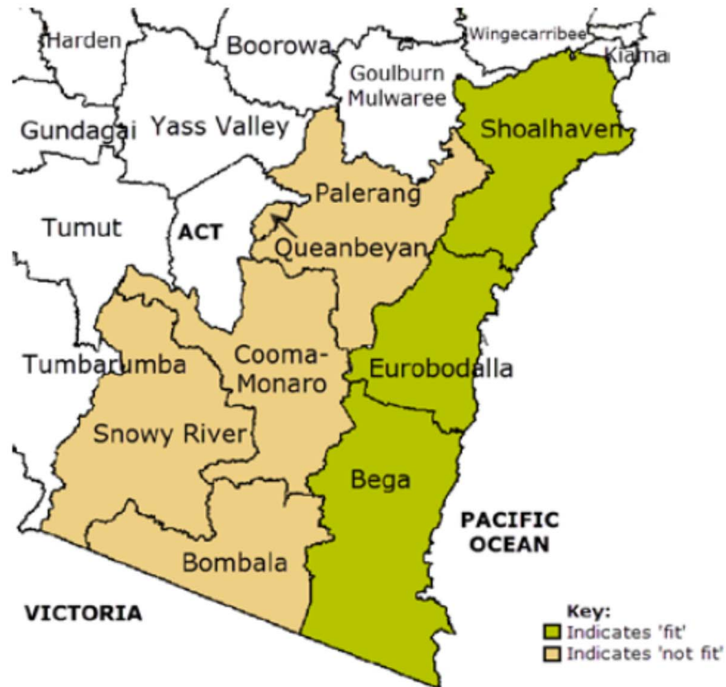
Figure 2.26 South East Region