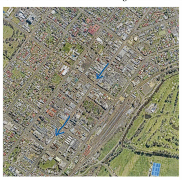
Example of Tally Page