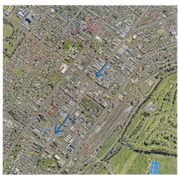
Example of Tally Page