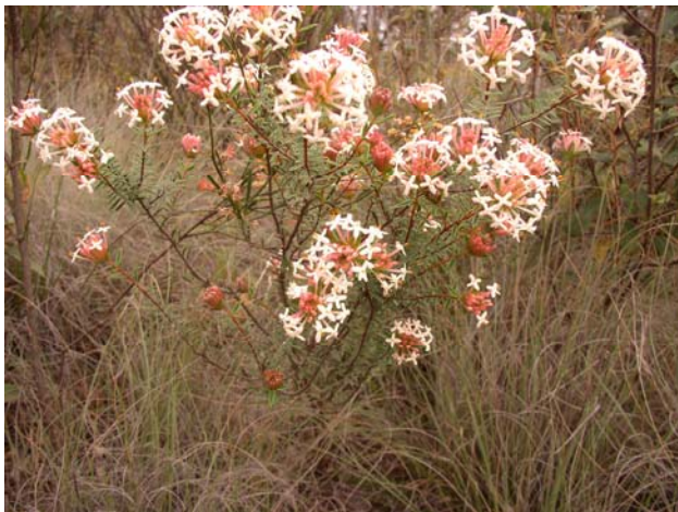
Pimelea ferruginea Pink Rice Flower