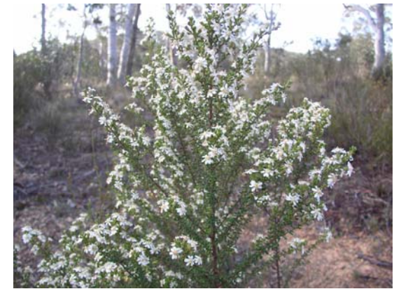
Olearia microphylla Daisy Bush