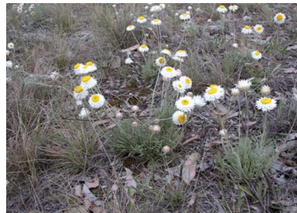
Leucochrysum albicans Hoary Sunray