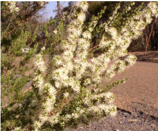
Kunzea ambigua Poverty or Tick Bush