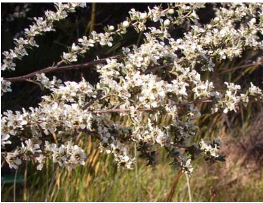
Leptospermum spp - Tea Tree