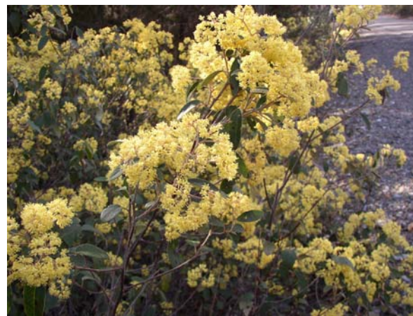
P. andromedifolia Common Pomaderris