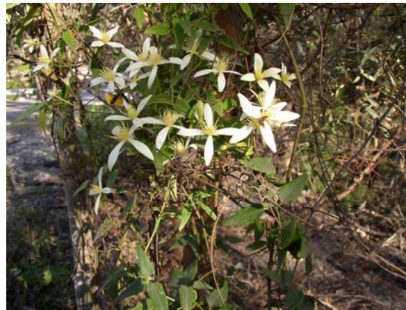
Clematis aristata Old Man's Beard