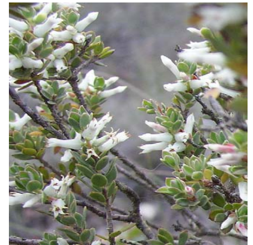
Brachyloma daphnoides Daphne Heath