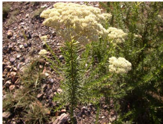
Cassinia aculeata Dolly Bush