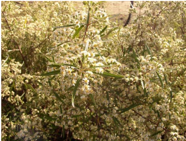
Olearia viscidula Wallaby Weed