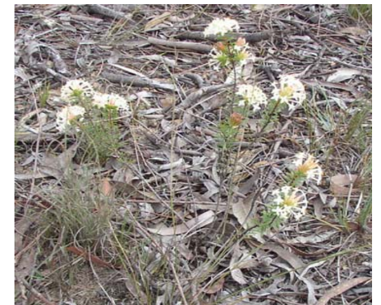
Pimelea linifolia Granny's Bonnet