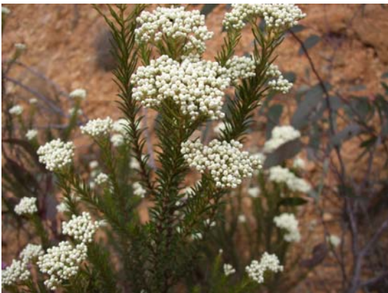
Ozothamnus diosmifolius White Dogwood