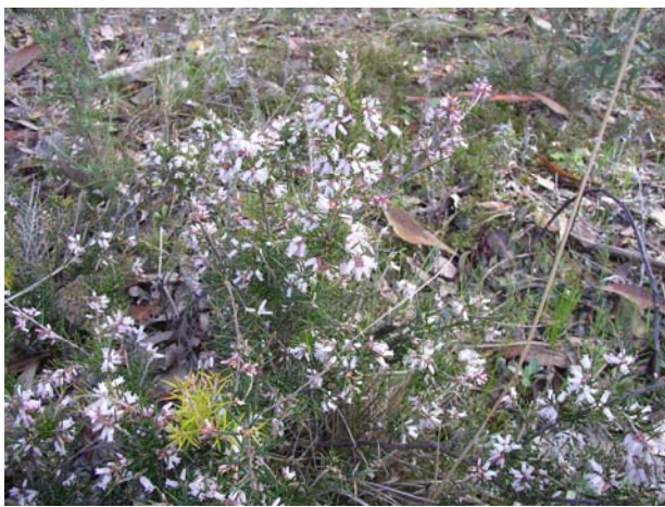
Lisanthae sribosa Peach Heath

Some native flowers seen along the roadside during spring 2009 and summer 2010.