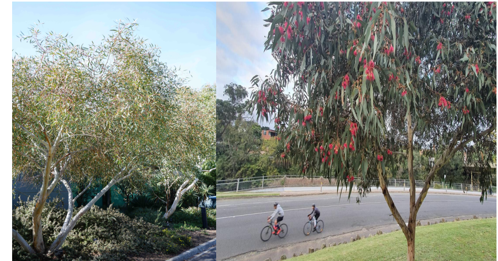
DWARF SNOW GUM EUKY DWARF