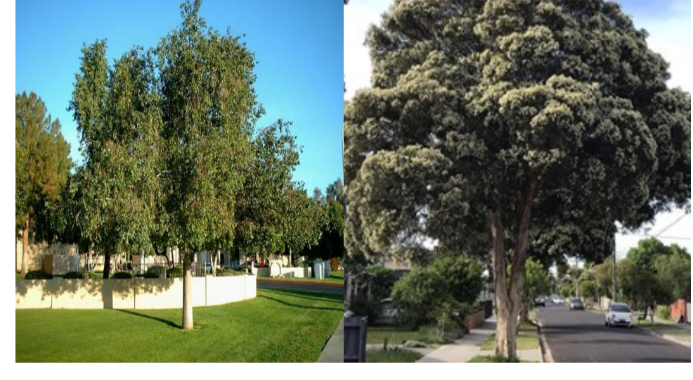
TASMANIAN BLUE GUM PRICKLY PAPERBARK