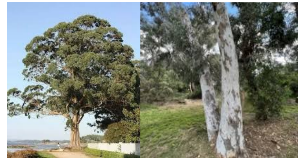
LOMANDRA 'TANIKA' CHINESE FOUNTAIN GRASS

Trees: Prepared holes to be 4 times the width of the tree ball and as deep as the root ball with sloped sides. The root collar should be at ground level. Backfill when straight and in position creating a water basin to maximise watering. Water in well. Water 7-10 days at drip line. Tube stock to be watered every 2 days in summer and every 3 days in winter for 2-3 weeks depending on rain. Trees should be fertilised with slow release fertiliser every 3.6 & 12 months and Tree Guards to be used for the first 12months.