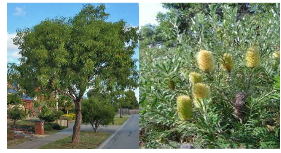
KURRAJONG SILVER BANKSIA 'BRIGHT'