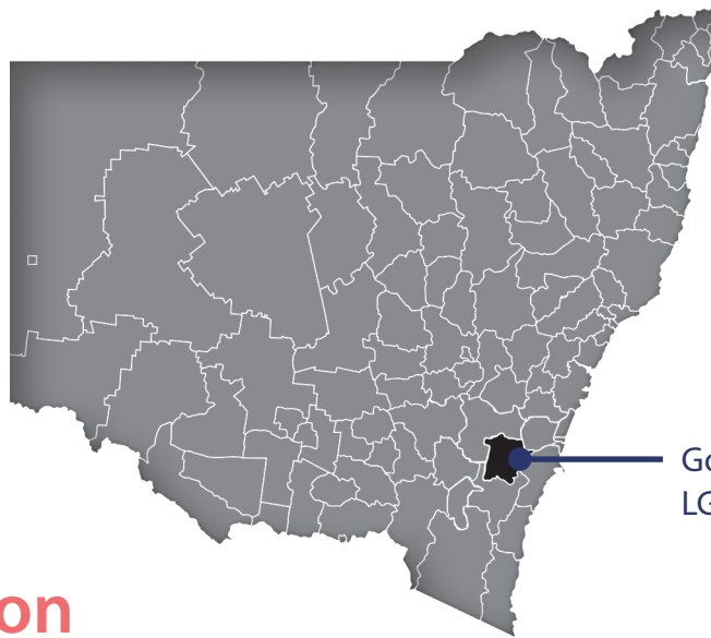
Goulburn Mulwaree LGA