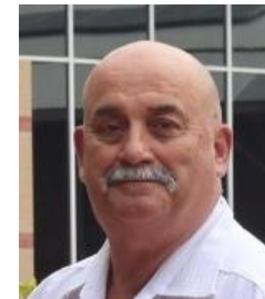
Mayor Cr Peter Walker