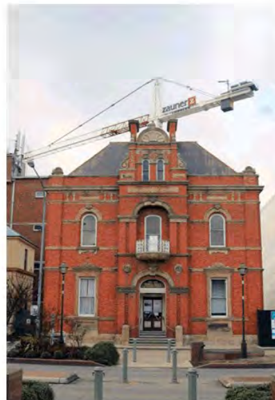
The Centre is scheduled to open towards the end of 2021.