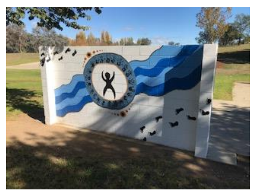
Leggett Park Mural – Eastern Side of Wall